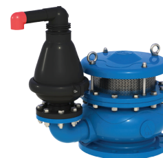
VB-060 + D-025

Please see the table below for all the additional air valve options available.